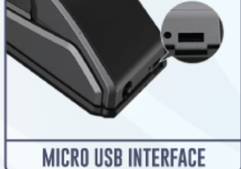
MICRO USB INTERFACE