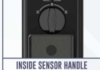
INSIDE SENSOR HANDLE