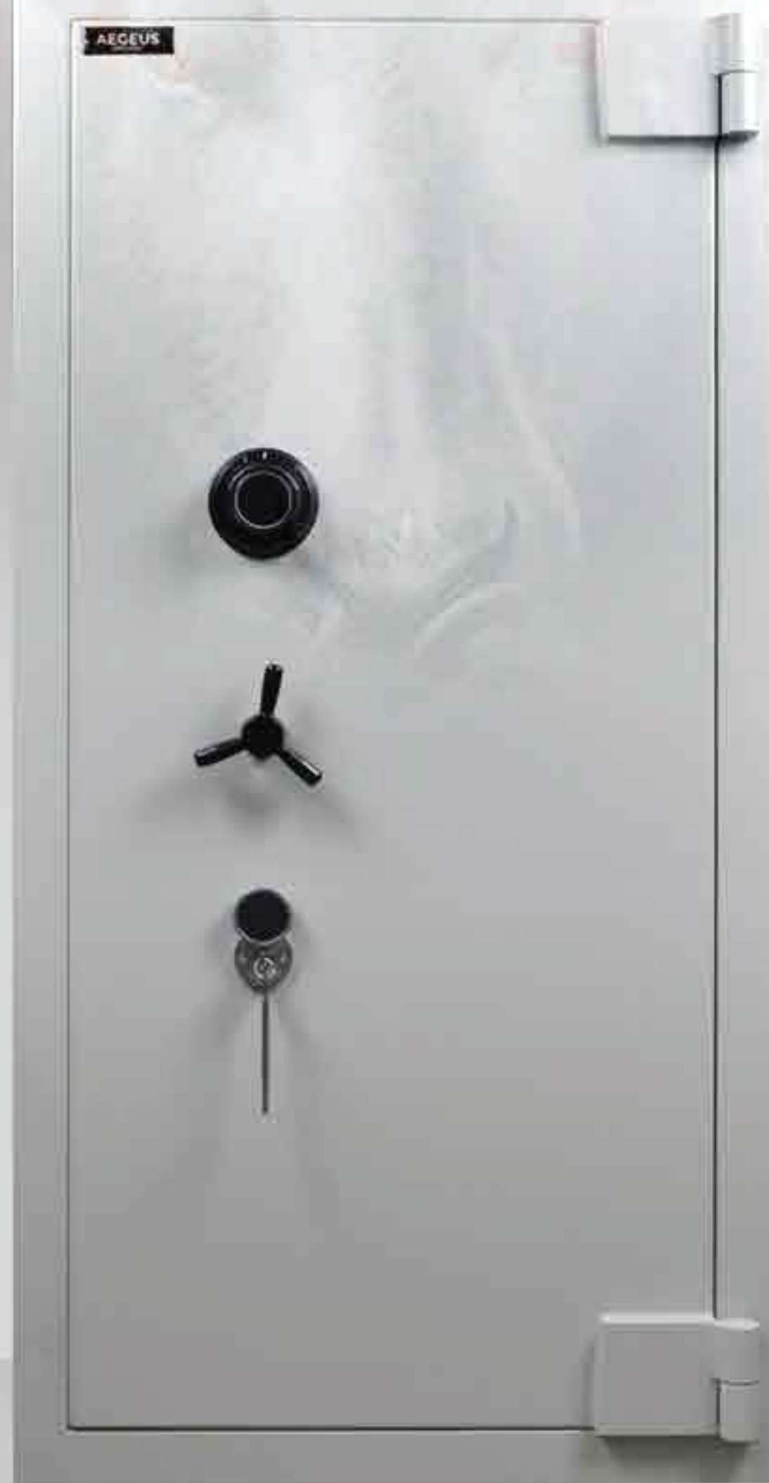
AEGIS SERIES PREMIUM SAFE